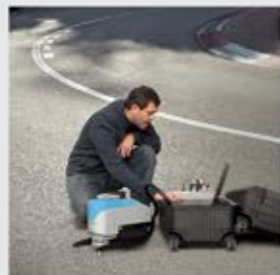
Measurement on a Racetrack